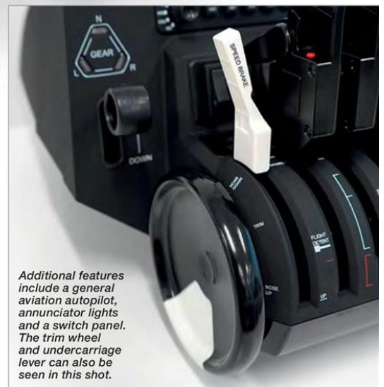
Additional features include a general aviation autopilot, annunciator lights and a switch panel. The trim wheel and undercarriage lever can also be seen in this shot.

To set the Bravo up, we simply attach the relevant General Aviation or Commercial handles. Once everything is in place, any lever not used can be covered with a rubber boot to hide it away. For example, a Boeing 747 will require all six axes: four thrust levers, one flap handle and a speed brake. A Cessna 152, on the other hand, will only need two axes: one for the throttle and a second for the mixture so the remaining axes in this case can be covered by rubber boots to hide them away. To reconfigure the Bravo, simply remove the relevant rubber boot and attach the appropriate lever. It is seamless and a great way to configure a simulator for flying multiple aircraft types.