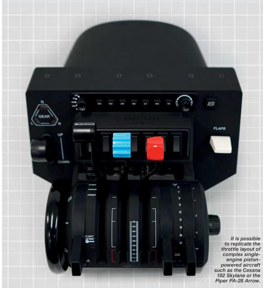
It is possible to replicate the throttle layout of complex single-engine piston-powered aircraft such as the Cessna 182 Skylane or the Piper PA-28 Arrow.

detent on the axis but the downside is the speed brakes will work in reverse.