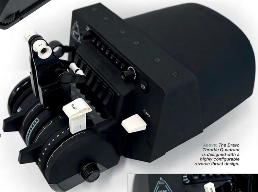
Above: The Bravo Throttle Quadrant is designed with a highly configurable reverse thrust design.

The second set of handles is for commercial jets or airliners and is loosely based on a Boeing 737-style throttle quadrant, although it can be configured for aircraft with up to four engines. It consists of four identical thrust levers along with two additional handles, one for the flaps and a second for the speed brake, which are attached to the far-right and far-left axis respectively. Like the GA set, the thrust lever for engine No.1 is also fitted with a TOGA button. Each of the engine's handles is