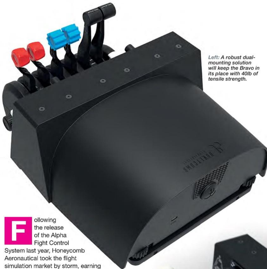
Left: A robust dual-mounting solution will keep the Bravo in its place with 40lb of tensile strength.

Apart from the actual throttle levers, the Bravo comes with plenty of additional features. A friction knob sets the 'stiffness' of the axis, which works smoothly and seamlessly. There is also a two-way GA-type flap switch so it is possible to use either the flap lever for flying airliners, or for general aviation we can use the two-way flap switch. Additional features include an undercarriage handle with green/red lights to indicate the status of the landing gear and a GA-style elevator trim wheel. The Bravo is also equipped with a general aviation type autopilot with backlit buttons, which can be used for selecting various modes such as heading, altitude, vertical speed and approach, etc. A five-way selector switch is used for jumping between different modes while a rotary knob dials in the settings such as desired heading or altitude. Below the autopilot, there are seven programmable two-way switches which can be assigned to operating the aircraft's systems such as pitot heat, external lights, ▣